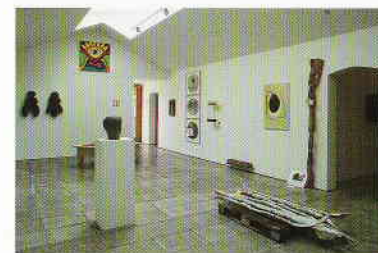
Towards The Millennium, July - September 1999

...ArtSway...make(s) everyone look again... MAKE the magazine of women's art, Sept-Nov 1999